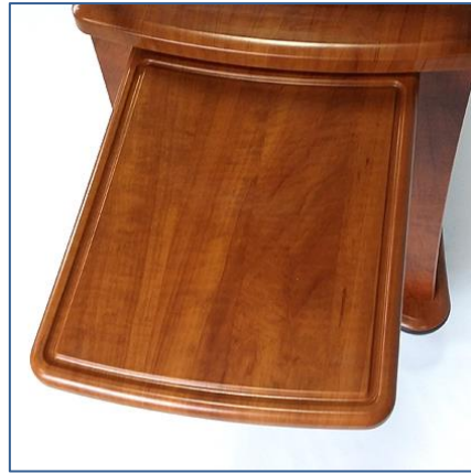
Optional pull-out chart board.