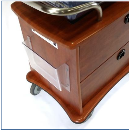
Optional chart holder.