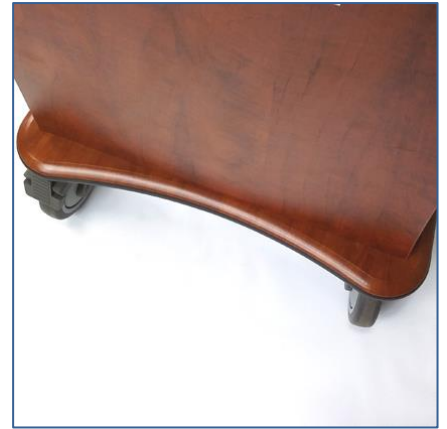
Shin saving base design.