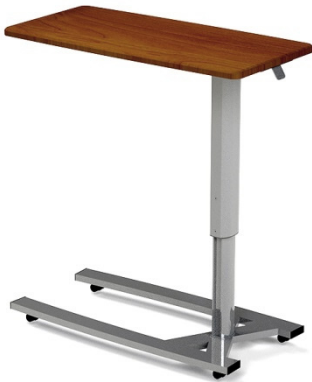
Overbed Table - 39" Width, Shown here in Summer Flame