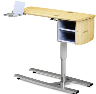
Overbed Table - 2-shelf, 46" Width, Fusion Maple,