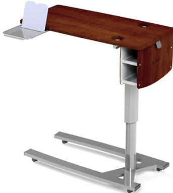
Overbed Table - 2-shelf, 39" Width, Summer Flame,