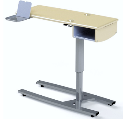
Overbed Table - 1-shelf, 46" Width, Eiderdown