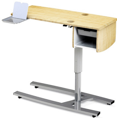
Overbed Table - drawer/shelf, 46" Width, Fusion Maple