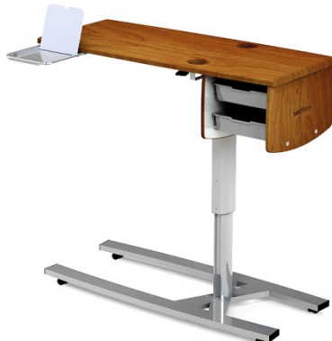
Overbed Table - 2-drawer, 46" Width, Honey Maple